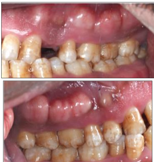
Fig 1: Preoperative view showing enlargement at maxillary left and right buccal region: